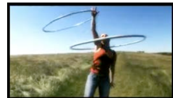
The Old Pair of Jeans Fatboy Slim