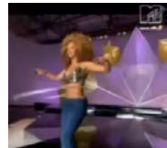
Work It Out Beyonce